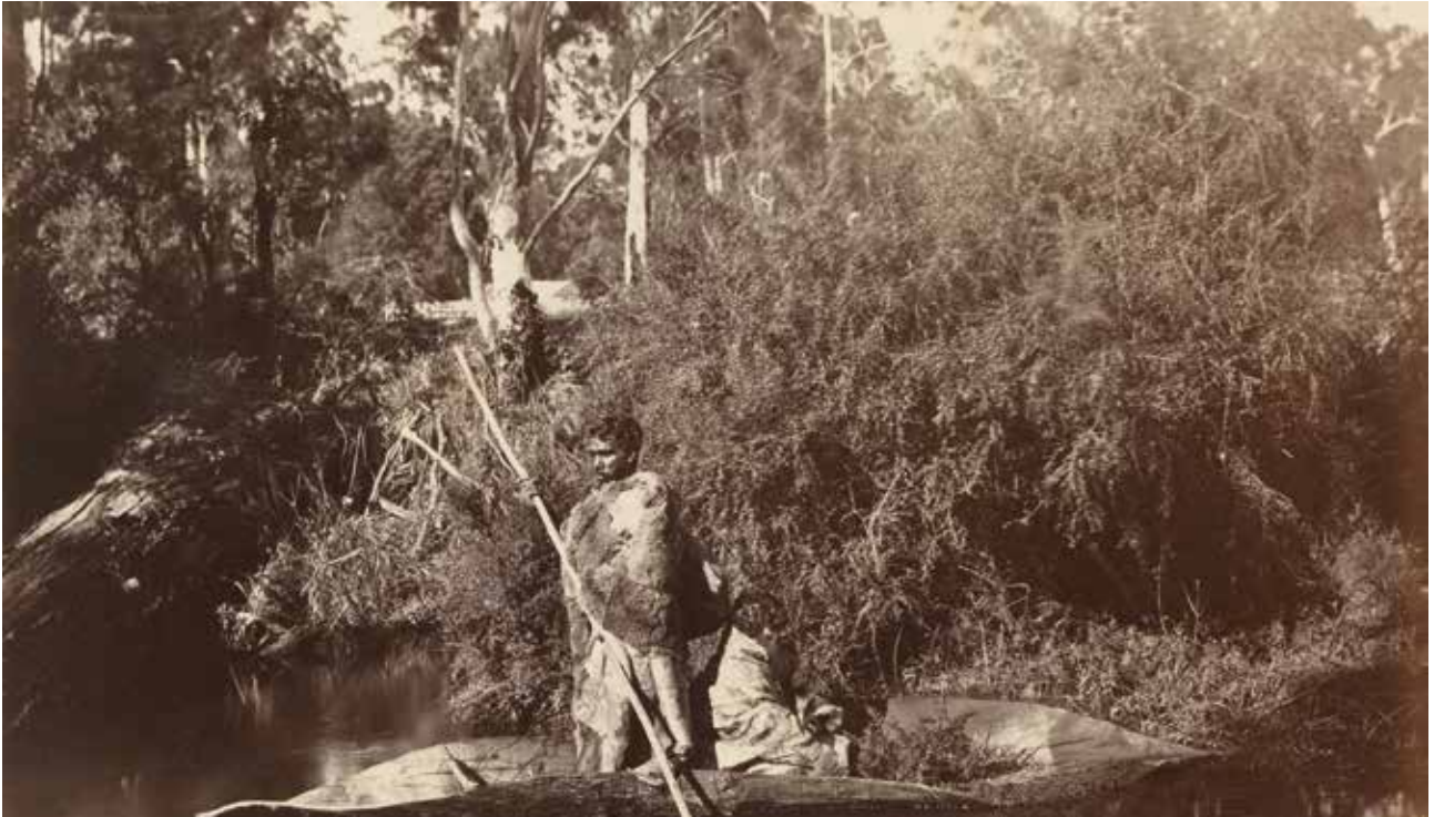
Aboriginal Men in Canoe by Fred Kruger, 1883. Courtesy of the National Gallery of Victoria.

The bark of large gum trees were cut from the trunk and shaped into canoes such that they could fish, hunt and travel along the river with ease.