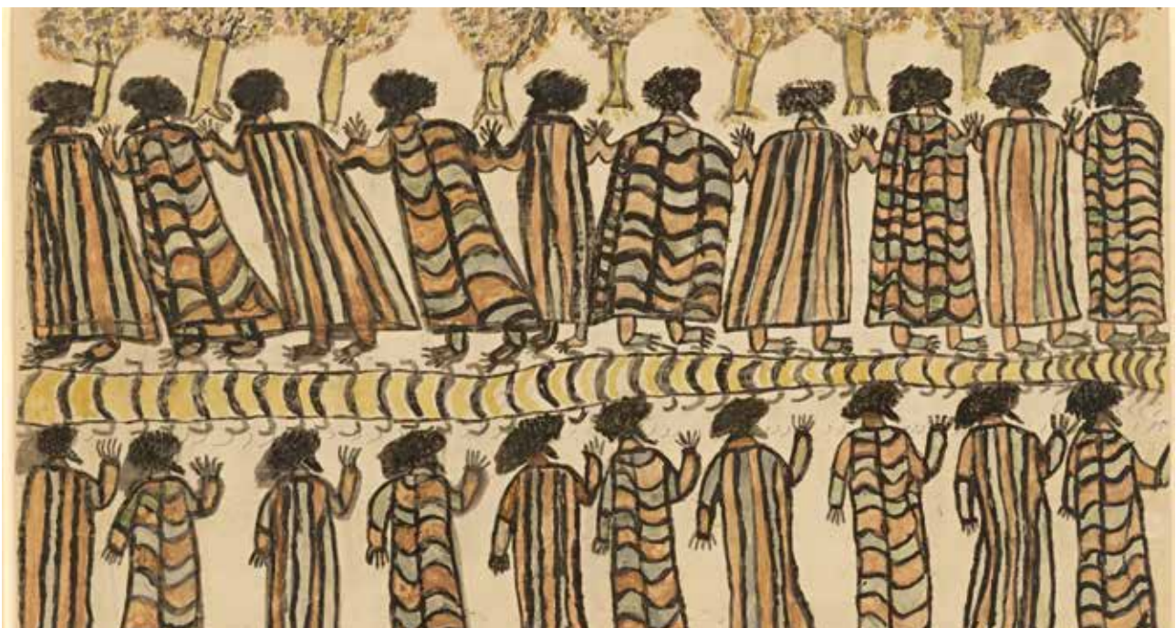
Figures in Possum Skin Cloaks by William Barak, 1898 Courtesy of the National Gallery of Victoria

The Tanderrum still forms an integral part of being a Wurundjeri person today.