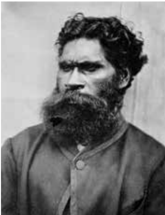
William Barak of the Yarra Yarra (Wurundjeri) Tribe, age 33.