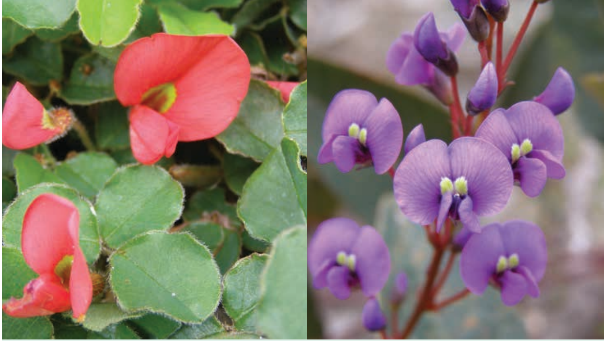
Left to right: Kennedia prostrata (also known as running postman) and Hardenbergia violacea (also known as false sarsaparilla, purple coral pea and waraburra).