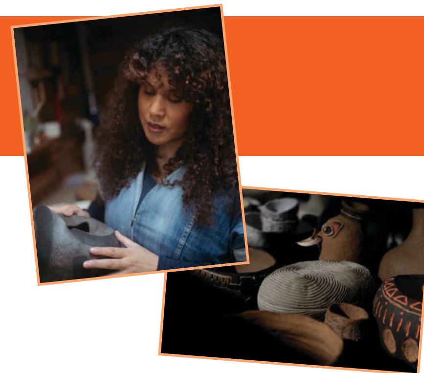
ABOVE: kose karu kin (detail view).

Through the yearning for using my body; my hands, and breath – I'm exploring clay making, limestone sculpting, wood carving and printing.