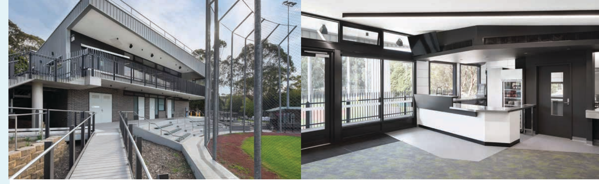
ABOVE: Completed upgrades at Deep Creek Pavilion in Doncaster East.