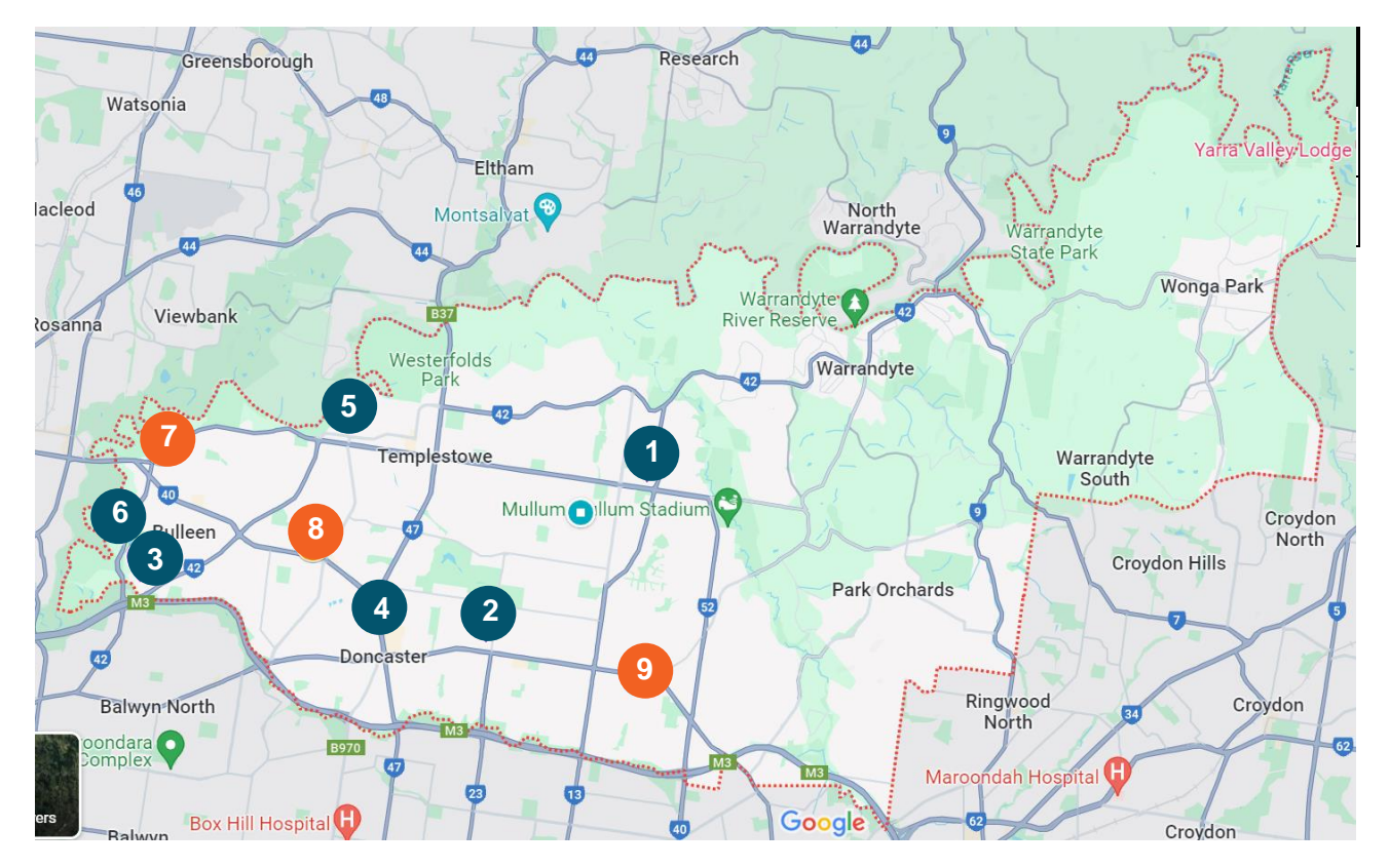
Figure 1: Location of Manningham gaming venues